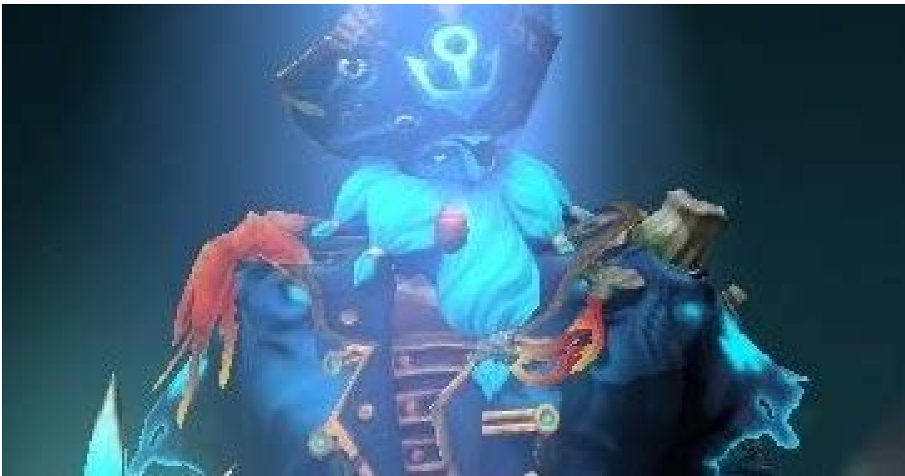
Ancient apparition dotabuff guide. Dota 2 ancient apparition guide.